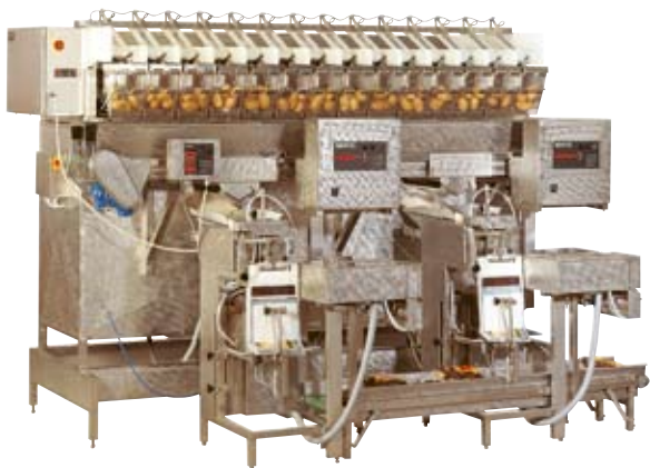
Multi-head weigher for vegetables, fruits and berries.