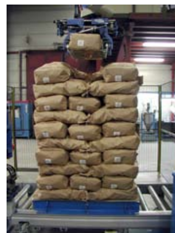
Robot palletizing of sacks, cardboard –or plastic boxes etc.