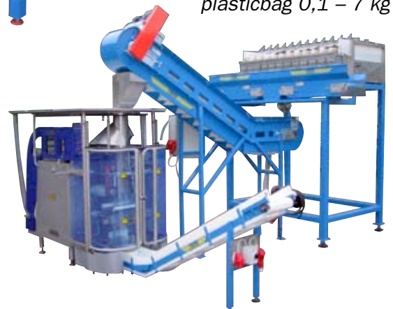
Verticalbagger for plasticbag 0,1 – 7 kg

EMVE delivers complete lines for packaging in paper, plastic, net and tray. Capacity up to 100/min.