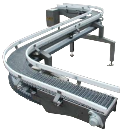
Rib conveyor for trays, bags and boxes.