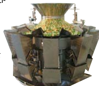
Multi-head weigher for compact solutions with high capacity.