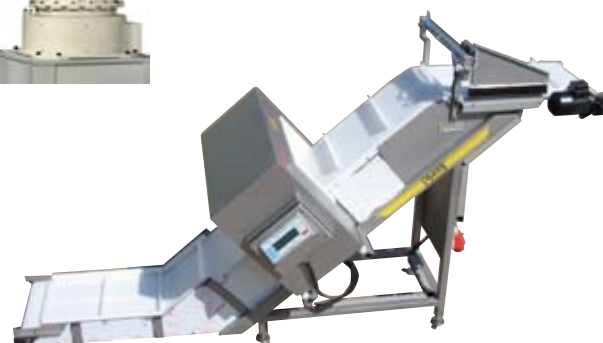
Checkweighers and metal detectors.