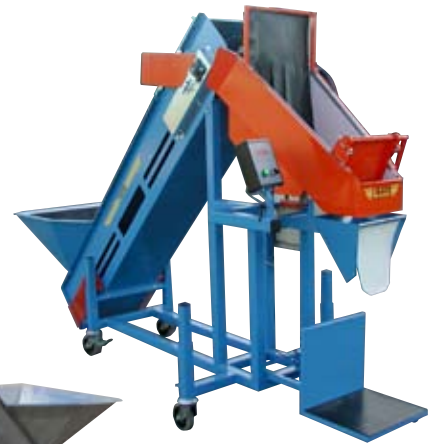
For sack and box 5 – 300 kg