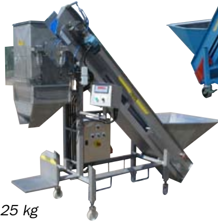
Processed vegetables etc. 5 – 25 kg