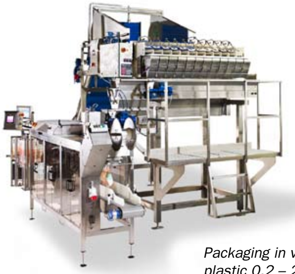
Packaging in v-film plastic 0,2 – 25 kg