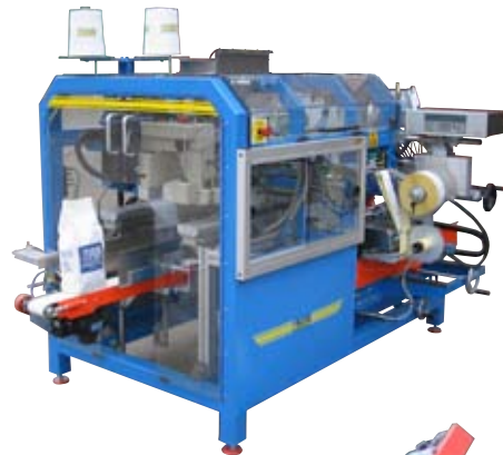
Paperbagger 1 – 10 kg