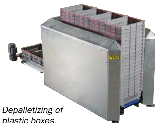
Depalletizing of plastic boxes.