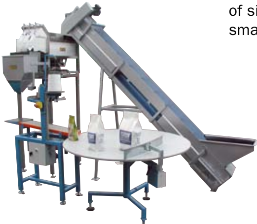
Packaging and sealing 0,5 – 5 kg

EMVE produce a wide range of simple solutions for small and high capacities.