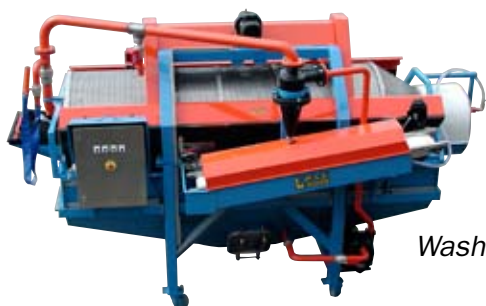
Washing 1–15 t/h