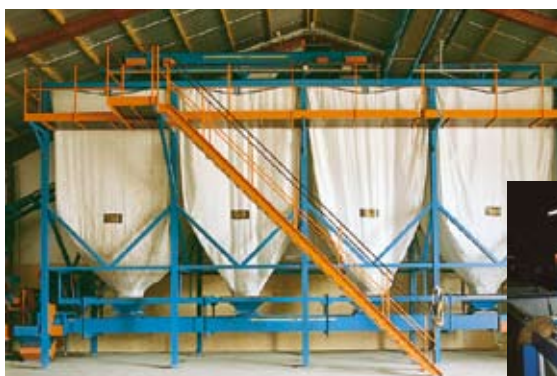
Storagebuffers, 1–25 m 3