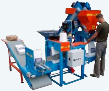
Semi automatic packaging