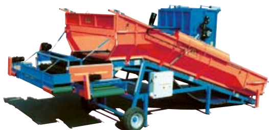
Intake from bulk or box

EMVE designs and manufactures intake for bulk, box and jumbobags. Filling into boxes or storagebuffers comes in many versions. Flow weighers and samplers can also be integrated.