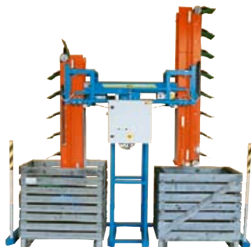
Box and jumbobag fillers