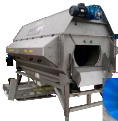
Polishing 1–25 t/h