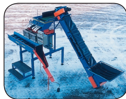
Double weigher, with reversible conveyor.

with individually adjustable vibration and pneumatic damper make for accurate yet rapid weighing into predefined batch weights. Bag supporter can be adjusted to suit individual operators.