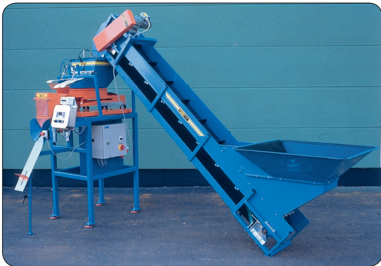
W-5 with single scale.

For weighing potatoes, onions etc in 0,5–5 kg batches