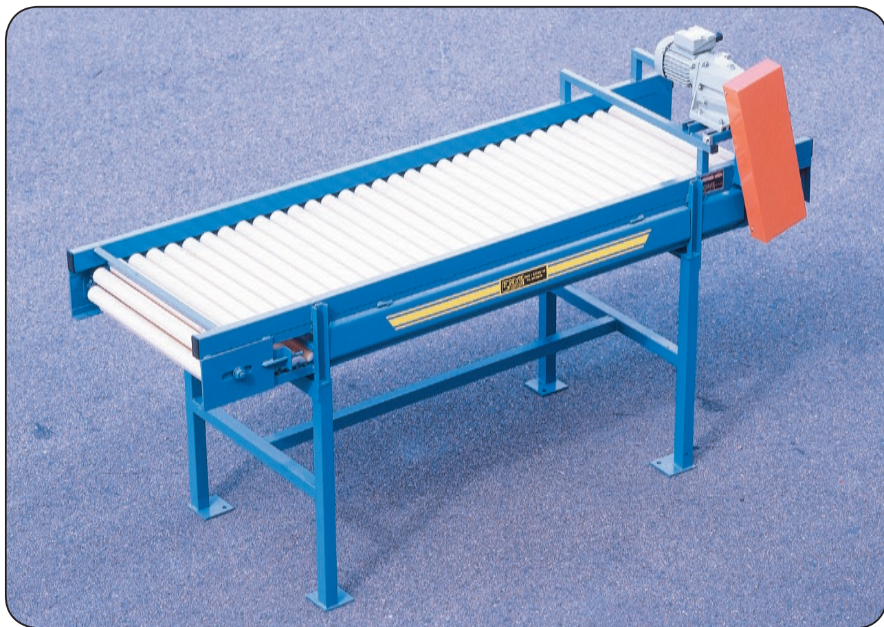
RT 500x2000 roller table

For inspection and manual grading of potatoes, root vegetables etc