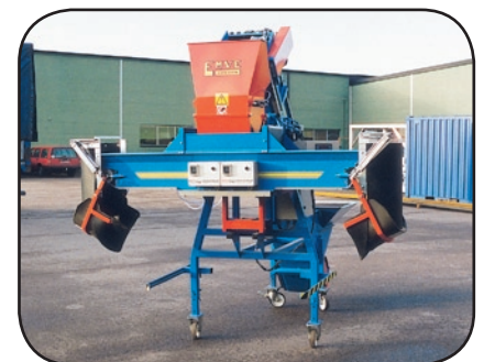
Double boxfilling version.

By reversing the conveyer, the weigher can quickly be adapted for filling sacks in the same way as the ordinary W -50 automatic weigher.