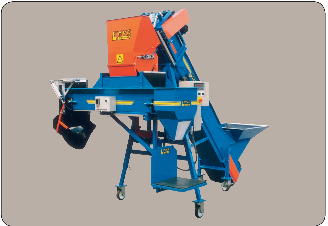
W 50 LC automatic weigher with fall breaker for filling boxes etc

For filling of roller containers, octabins and other boxes or sacks