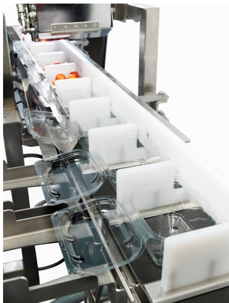
NBM61 with lid closer unit