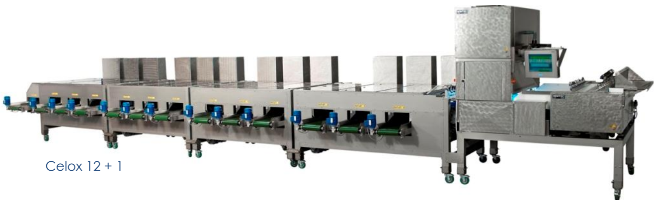
Celox 12 + 1