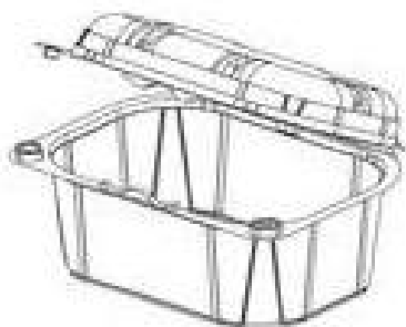
Infia Kit 250

The NBM61 with lid closer unit has a capacity and a speed for up to 55 clamshells pr. minute. The clamshells are the version Infia Kit 250, which is produced by Infia in Italy. The NBM61 with lid closer unit can also be made for other punnets, but the clamshell Infia Kit 250 is the most used and popular. Normally the clamshells are used for cherry tomatoes in 250 grams, but it is also available for other models. The NBM61 with the lid closer unit has already been delivered with success for MacPak in Spain.